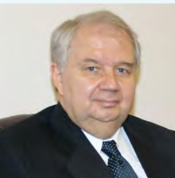
Sergey I. Kislyak, Ambassador of the Russian Federation