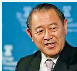
Ichiro Fujisaki, former Ambassador of Japan to the United States