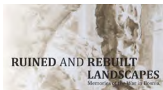
Exhibit and Events to Commemorate War in Bosnia

“Ruined and Rebuilt Landscapes: Memories of the War in Bosnia” is an upcoming exhibition, running from March 17 to April 3 in the Northeast Lounge of the Cone Center. The exhibition