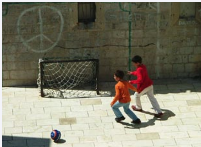
In Dubrovnik, Croatia, children play soccer in a small courtyard. The peace sign serves as a reminder of Croatia's turbulent past.