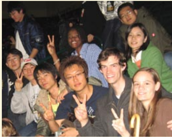
Korean students and new friends take in a basketball game,

The most recent program hosted 28 Korean students from Kyungpook National University in Taegu, Korea. Over the four-week curriculum, which ended February 3, 2006, students engaged in an intensive engineering design course, toured research labs and explored the library facility; they were introduced to research initiatives by current UNC Charlotte Department of Computer and Electrical Engineering faculty; students participated in English training courses, lectures on the ramifi-