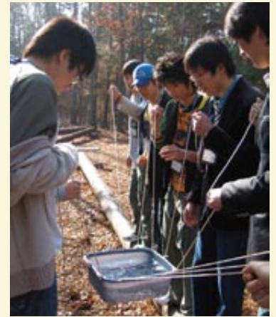
Kyungpook National University visitors participate in a team-building activity.

cations of globalization, teambuilding exercises and discussions, and Charlotte area excursions led by faculty and staff from UNC Charlotte; they were also shown opportunities for graduate study at UNC Charlotte and given an overview of the graduate admissions process. These were all made possible by the participation of faculty and staff at UNC Charlotte who shared knowledge and time in their area of expertise to contribute to a holistic learning experience for the Korean visitors.