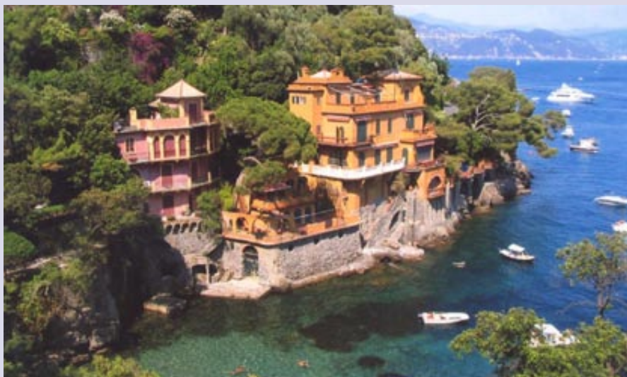
Office of Education Abroad Student Photo Contest Photo Contest 2005 Category: Landscapes • First Place: Christina Curcuru • Major: Health Fitness • Location: Italy • Caption: I found my love in Portofino!