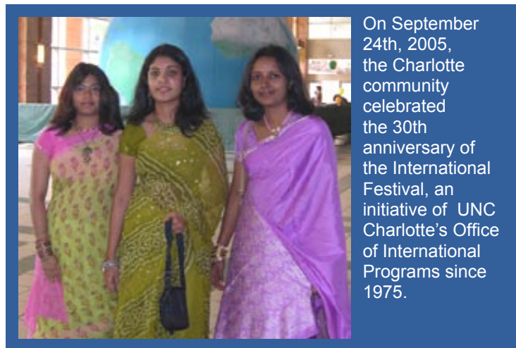
On September 24th, 2005, the Charlotte community celebrated the 30th anniversary of the International Festival, an initiative of UNC Charlotte's Office of International Programs since 1975.