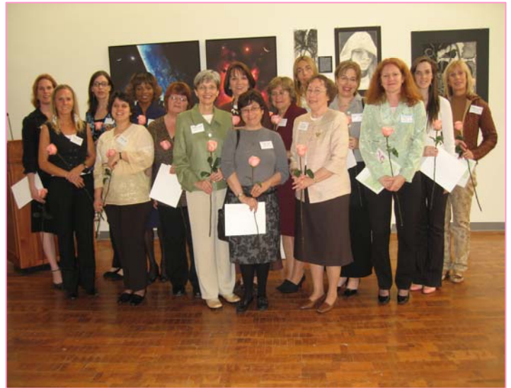
For a full listing of the honorees please visit the OIP website at http://www.oip.uncc.edu/intwomenday.htm