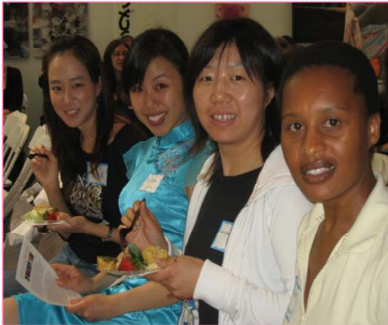
International Women's Day Celebration Attendees

One of the keys to the success of this event is the collaborative efforts of the International Women's Day Planning Committee, because it unites the campus community in this important celebration