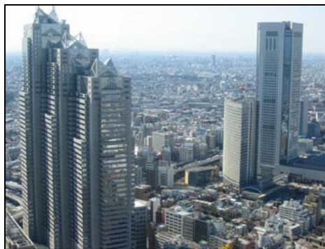
Aerial View of Tokyo, Japan