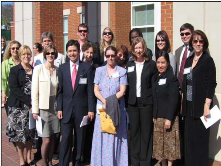
The OIP Staff attends the College of Health & Human Services Building Dedication on April 13, 2007.