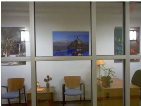
ELTI Reception Area