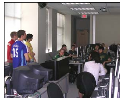
Study Abroad Students Speak at Nihon Club Meeting

language courses as "challenging." She talked about how easy it was for her to travel, and of the many places she visited while studying at Obirin, including Seoul, Kyoto, Osaka, Naha, Okinawa, and Nara. Her last bit of advice and reassurance was