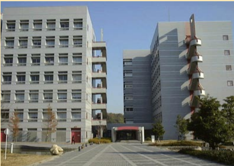
NAIST Information Science Building

The professors will be at UNC Charlotte September 24 – October 7, 2006. They will also attend various cultural and recreational events in addition to their professional and academic activities.