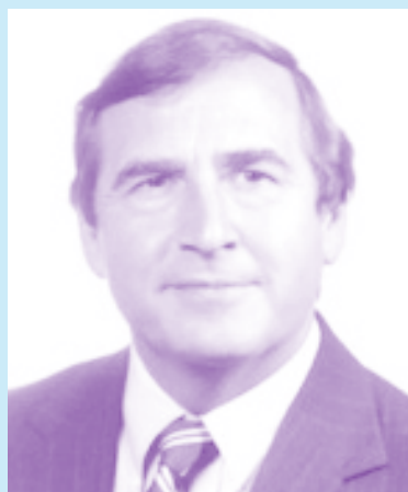
Dr. Graham Allison

On November 6, 2006, 6:15 PM at the Renaissance Hotel in Charlotte, the World Affairs Council of Charlotte (WACC) will host its annual fundraiser and recognition dinner. This year, the WACC will be honoring Dr. Graham Allison with the World Citizen Award. The award is presented annually to recognize a prominent world citizen with ties to the Carolinas. Allison was born in Charlotte, NC and graduated from Meyers Park High School. Since then he has held numerous distinguished posts in government and academia including Assistant Secretary of Defense in the first Clinton Administration and founding dean of Harvard's John F. Kennedy School of Government. Currently, Allison is Director of the Belfer Center for Science and International Affairs. Please plan to join us for an evening recognizing the accomplishments of Dr. Graham Allison. Tickets are now available for purchase. More information is available at www.charlotteworld.org .